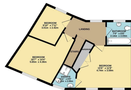
TOTAL FLOOR AREA: 1127 sq.ft. (104.7 sq.m.) approx.

While every attempt has been made to ensure the accuracy of the description contained here, measurements of doors, windows, rooms and any other items are approximate and no responsibility is taken for any error, omission or mis-statement. This plan is for illustrative purposes only and should be used as such for any prospective purchaser. The services, systems and appliances shown have not been tested and no guarantee as to their operability or efficiency can be given. Made with Metrepro (2022)